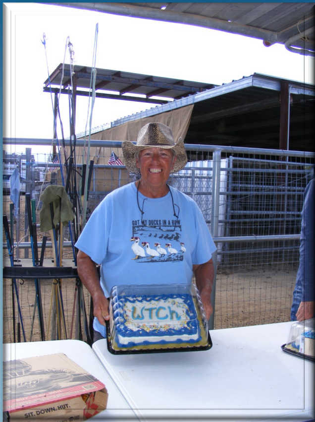
Check out the super shirt!! Have you seen it before?!

Cindy and HC, HTCh, WTCH Jax followed Cindy's HC, HTCh, WTCH Kix and HC, HTCH, WTCH Aim with lots of cakes!