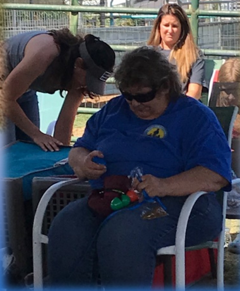
BCCAZ April 23rd Fun Day!!