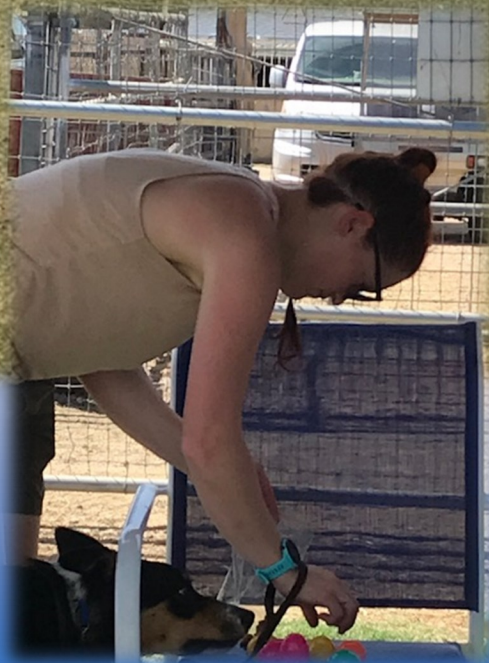
A lot of focus from dogs and handlers!